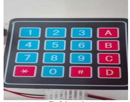
Fig 5: keypad

A keypad is a set of buttons arranged in a block or "pad" which usually bear digits, symbols and usually a complete set of alphabetical letters which is portable. If it mostly contains numbers then it can also be called a numeric keypad, but now a days we see the model which has both of numeric and alphabet keys. The keypad Switches are connected in a matrix of rows and columns. The rows and columns of the matrix are connected to four output port lines and four input port linesrespectively.