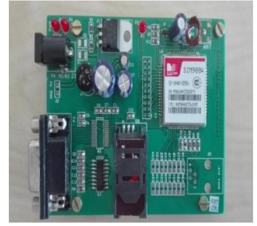
Fig 3: GSM module

are most frequently used to provide mobile internet connectivity all over, many of them can also be used for sending and receiving SMS and MMS messages, which is the specialized feature of them.