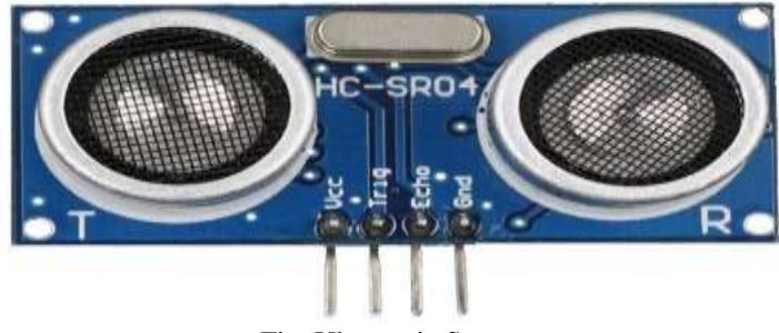
Fig. Ultrasonic Sensor

Since it is known that sound travels through air at about 344 m/s (1129 ft/s), you can take the time for the sound wave to return and multiply it by 344 meters (or 1129 feet) to find the total round-trip distance of the sound wave. Round-trip means that the sound wave traveled 2 times the distance to the object before it was detected by the sensor; it includes the 'trip' from the sonar sensor to the object AND the 'trip' from the object to the Ultrasonic sensor.