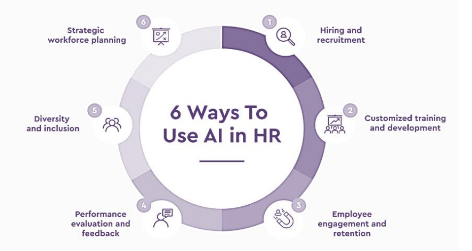
Figure 1. Six Ways to use AI in HR [14]