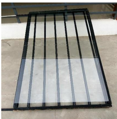
Fig 1 Arrangement diagram for the experimental setup