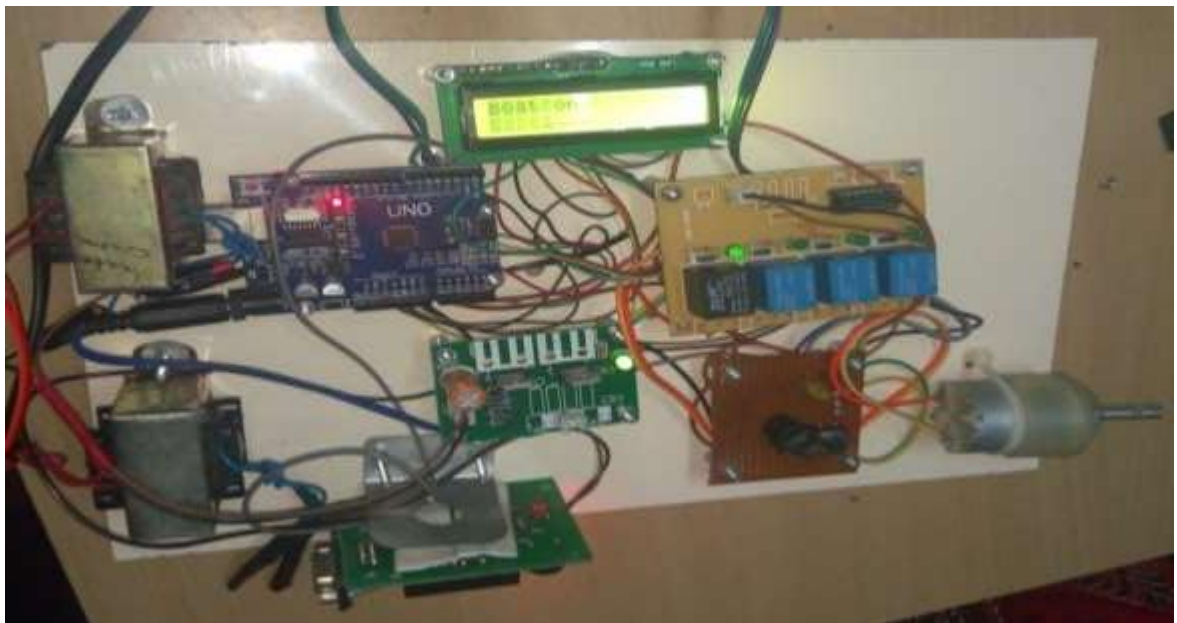
Fig. 2. Overall Hardware Output