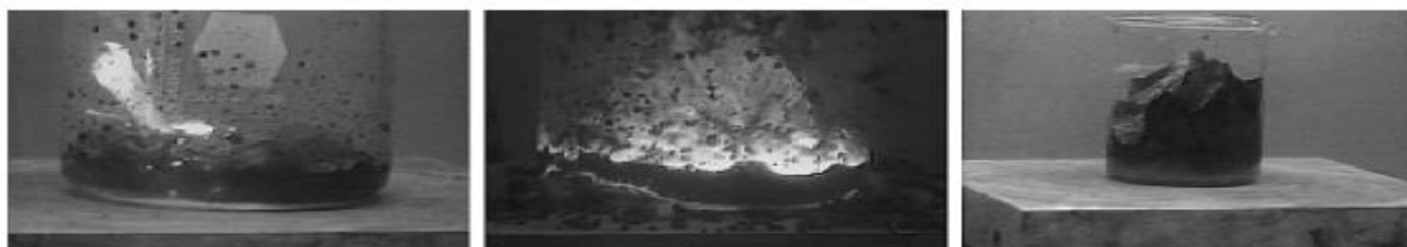
Fig 1: The mixture boils foams and ignites to burn with flames to yield voluminous foamy Ni doped cerium Oxide.