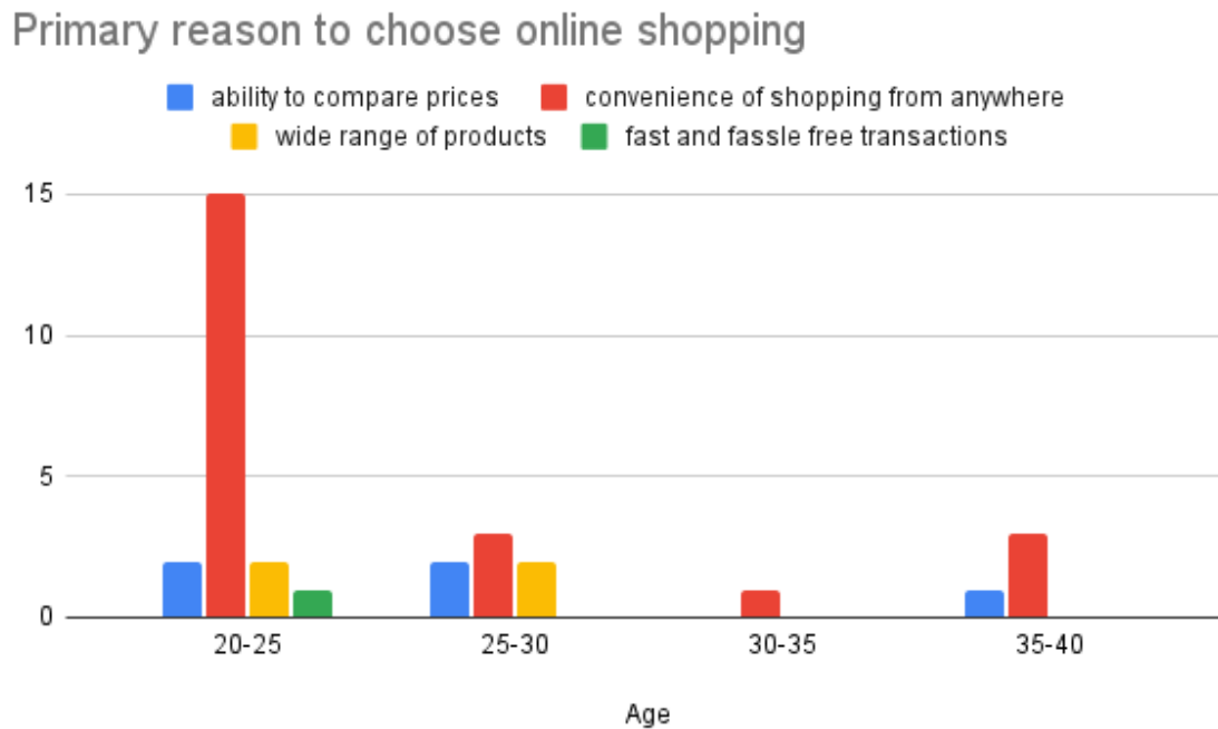
Figure 1: PRIMARY REASON TO CHOOSE ONLINE SHOPPING