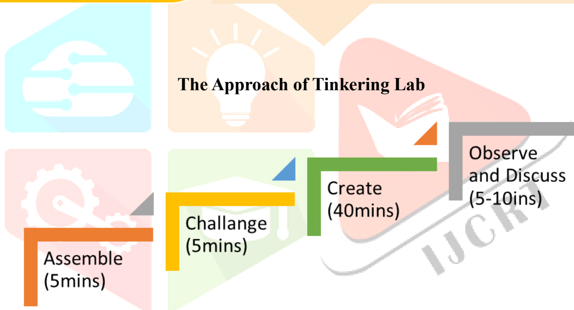
Fig. 2 The Approach of Tinkering Lab