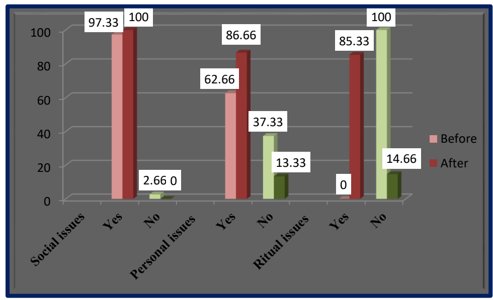
Fig: 1Knowledge about the types of issues related to women

Before intervention, the majority of urban teenage girls 97.33 per cent had knowledge of social issues, which rose to cent percent after intervention, as shown in table and fig. 1.