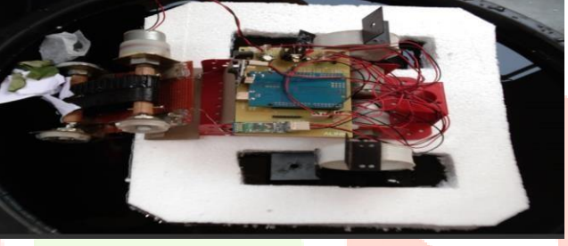
figure 3. Water cleaning boat setup

River Surface Cleaning Water Boat covers an area of 35*45 cms on the water surface. The device is placed on a foam board with a free rotation slot for the propellers. And the PVC pipes under the boat help the which facilitates bringing the waste to the machine rather than moving the machine towards the waste. Arduino board, Bluetooth and ESP32 cam are powered with the battery or power supply of 12V.