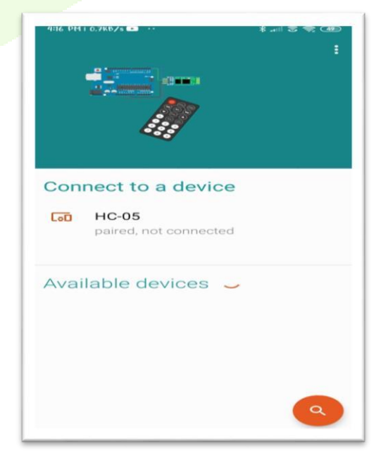
figure 2. Mobile App

Arduino Bluetooth Controller is the mobile app through which the motion of the boat is controlled. Bluetooth HC-05 when connected with mobile app, the commands given in the terminal mode of app will result the direction of boat's motion. Default Bluetooth name of the device is "HC-05" and default PIN (password) for connection is either "0000" or "1234". 'Paired and connected' message displays on the screen after it gets connected to boat. With the mobile App connected to boat, the boat is under control. Moving the boat away from obstacles in the right directions increases lifespan of boat. Remotely controlled rotation is an asset to the cleaning mechanism.