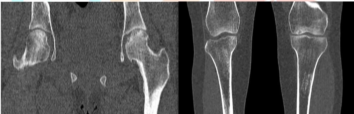
Figure 2 : bilateral damage of the knees and hip involvement