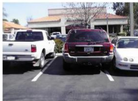
Figure 1.1: Automatic allotment Parking Figure 1.2: Manual Parking