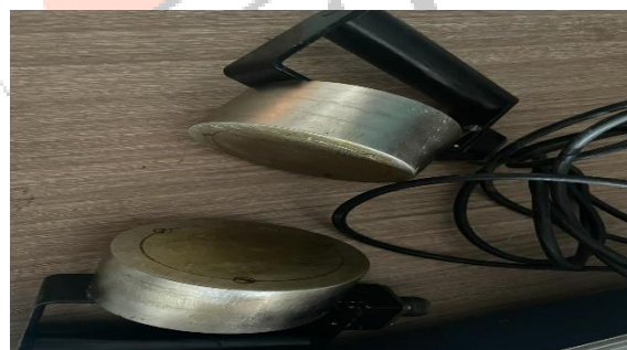
figure 3. transducer