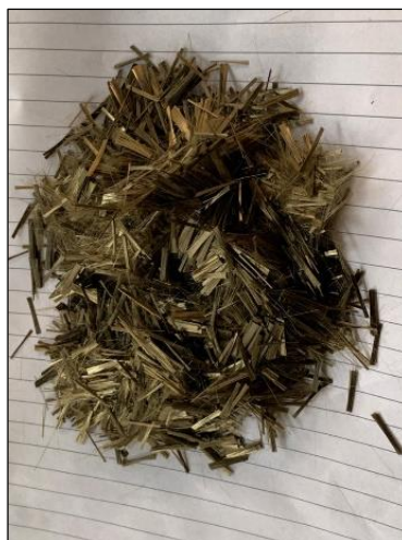
figure 1. basalt fiber

Basalt typically has less than 3% shot content.