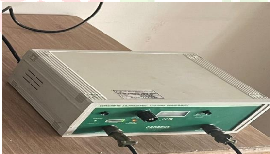
figure 2. ultrasonic pulse velocity