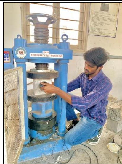
figure 5. UPV test