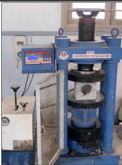
figure 4. compressive strength test