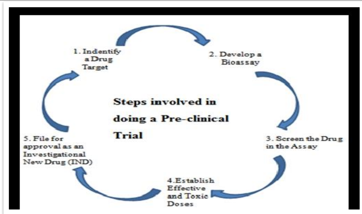
Figure 1 Steps involved in preclinical trial