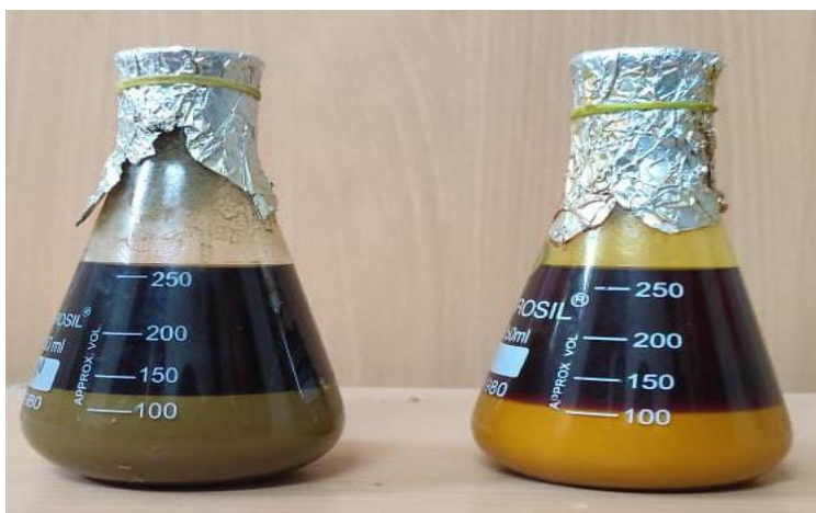
Figure 1: Maceration Process

Dried rhizomes of turmeric were ground and the powder obtained was followed for extraction same as that for neem leaves extract. The extract with crimson red colour was obtained and stored at cool and dark place in air tight container.