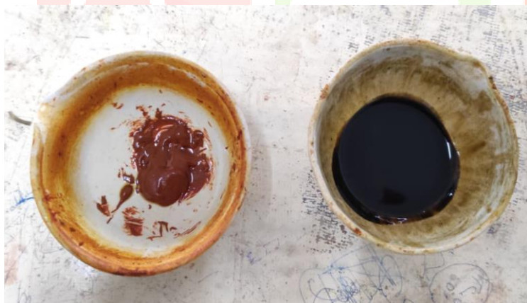
Figure 2: Crude extract of Turmeric and Neem