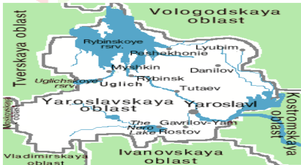
(Born Place of Liebedev)