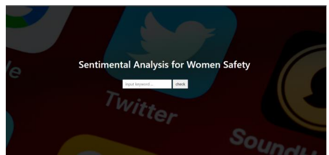
Fig. 2. Twitter API application website

To associate with the Twitter API and question most recent tweets to store them in the data set, make a record on Twitter apps.twitter.com/application/new and produce the programming interface keys expected to channel the program. The application settings are displayed in figure 2. Because of security reasons the API keys are not shown.