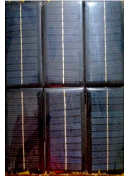
Camera Data display Distance measur. solar panel