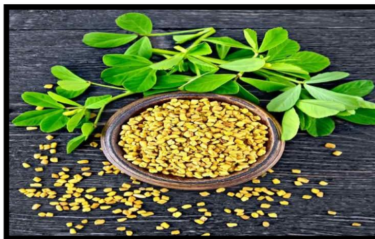
Fig no: 2

Fenugreek is used historically as demulcent, laxative, lactation stimulant and famous hypocholesterolemic, hypolipidemic and hypoglycemic exercise in healthful and diabetic animals and humans. The defatted seeds of fenugreek reduce gastrointestinal absorption of glucose and cholesterol and bile acids secretion.