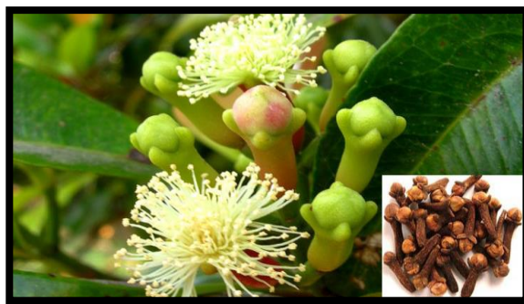
Fig: 1 clove