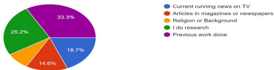
Fig 4: Above pie diagram showing various views of people.

Select the base on which you assess any political candidate? 123 responses