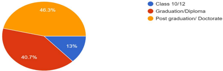
Fig 1: Above pie diagram shows the percentage of educated women with different levels of education undertaken in this study.

Sampling Method: Random samples have been collected from educated women using Random Sampling Technique under which each sample has an equal probability of being chosen. This technique is important for drawing accurate conclusions as the samples are meant to be completely free from any type of bias and provides the researcher with accurate representation.