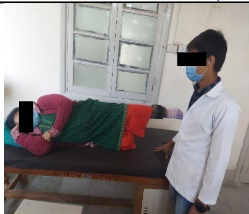
fig.: 6 quadriceps muscle exercise