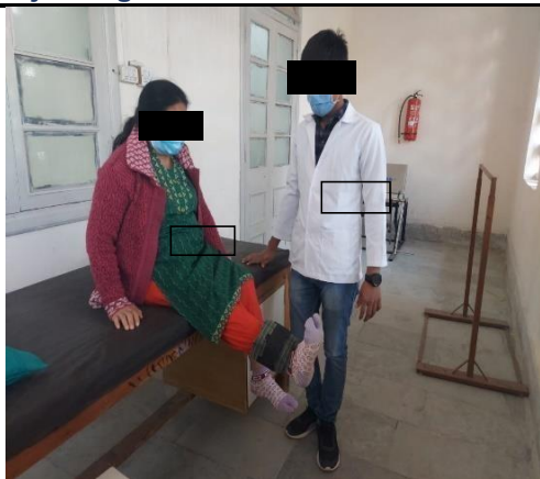
fig.: 5 hip abductor muscle exercise