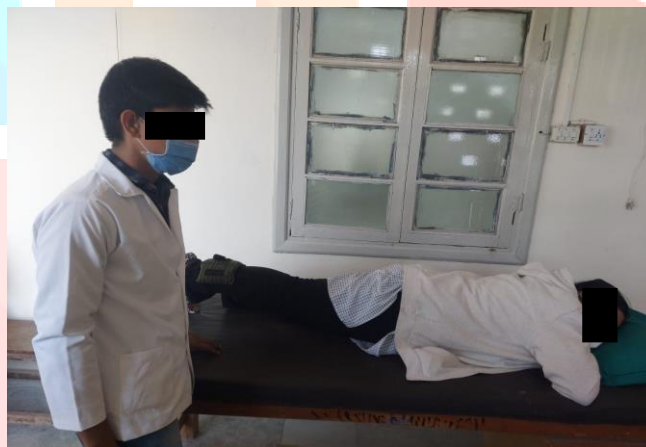
fig.: 7 hip extensor muscle strengthening exercise.

Position and procedure of the patient: The patient was positioned prone lying. In the prone position, subjects were asked to lie prone on a height-adjustable table; the therapist adjusted the height of the table prior to testing to allow the therapist to produce the best exertion. The initial testing position of the leg was with the hip in hyperextension at 20^\circ and the knee in full extension [52] and then held for a count of 10 for 10 repetitions. A weight cuff was tied around the ankle joint.