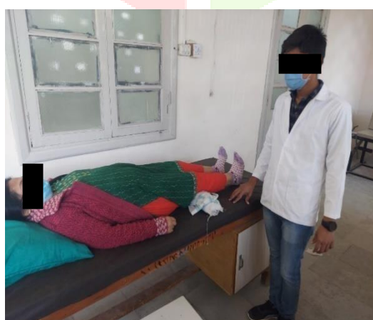
fig.: 3 quadriceps setting exercise

Each exercise was repeated 3 sets of 10 repetitions. The patient rested 1-2 minute after the completion of each set. Hot packs were used for symptomatic relieve and given 20 minutes before the exercises.