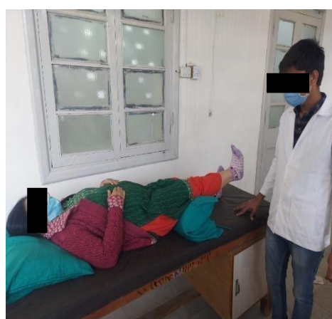
fig.: 4 short-arc terminal knee extension