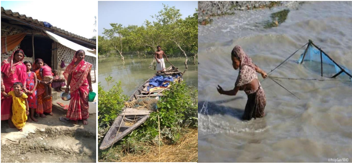
Bhumij Tribal women Tribal Fishermen adapted to local dress code

A special ceremony in the life of the tribals is the use of 'Sikka' marks on the body. This wound mark is used from the left elbow to the middle of the wrist. Wound marks are usually an odd number, i.e. one, three, five or nine. It is common for boys to use this sign at the age of twelve years. To give this sign, a piece of cloth is rolled up to a thickness of one and a half inches, its tip is set on fire and it is held in the hand. Similarly girls wear 'tatt' or 'khoda' mark from wrist to middle of elbow or chest. These symbols carry deep religious and national identity. In the tribal society of the Sundarbans region, the intention to adopt this special symbol has largely faded away.