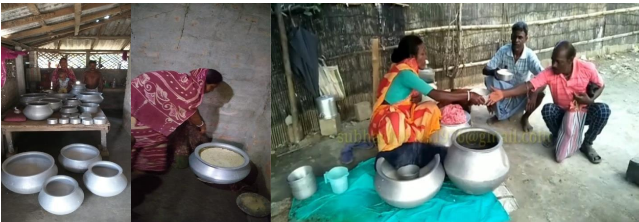
Tribal Women : Rice-beer preparer and seller

Economic decline has shifted the indigenous lifestyles of the region to one another. The struggle for survival of the landless indigenous people has intensified with the unfamiliar environmental conditions. They have managed to earn a living through the dangerous environment, ignoring the attacks of crocodiles in the water and tigers in the den. Many have penetrated the life of forest resources collecting honey, beeswax, wood. Many have directly mastered the art of fishing in the rivers and converted into fishermen. In particular, many tribal women have mastered the profession of crab fishing in rivers. Although hunting or catching fish in the river is not their traditional professional lifestyle, in a critical situation of living in the Sundarbans, they enter this profession and enter into a difficult cycle of family struggle. For this reason, there has been a special match between the indigenous communities of the Sundarbans region with their local customs. They have assimilated to the environment of the region due to their patriarchal lifestyle.