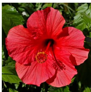
Fig. 5 Flowers of Hibiscus rosa sinensis

The stamens are fused to form a tube and the pollen grains are spiny in nature.