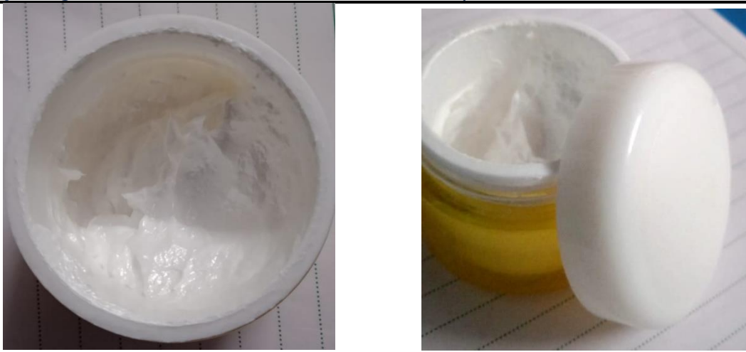
Fig. formulation of turmeric cold cream