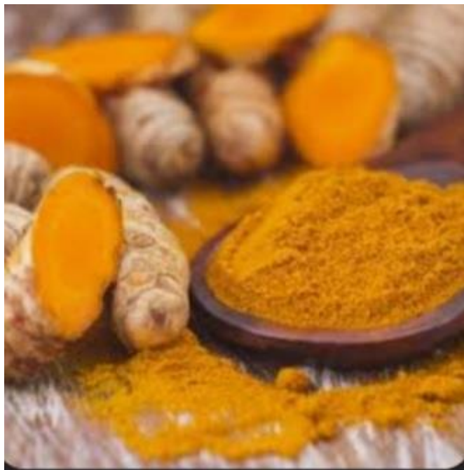
Dig. No. 2: TURMERIC