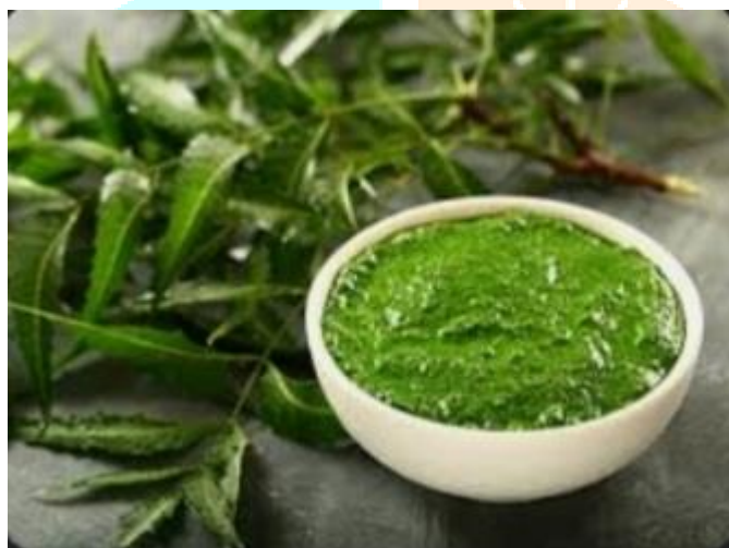
Fig. No. 1: NEEM