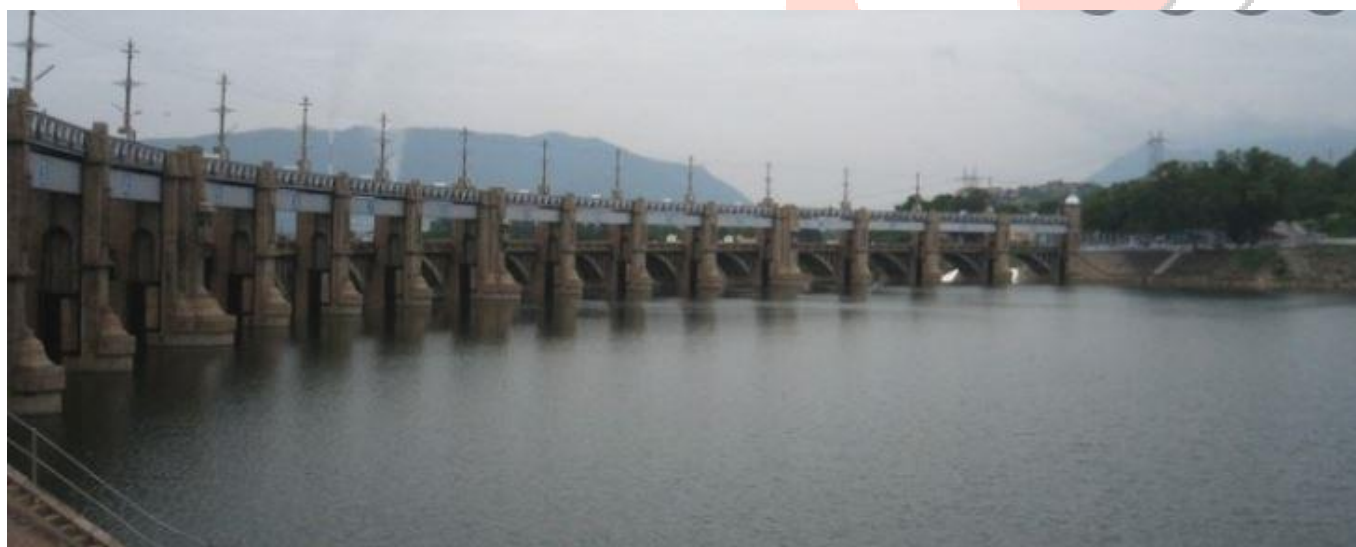
Photo.1 Mettur Dam site and varieties of fish in cauery basin.