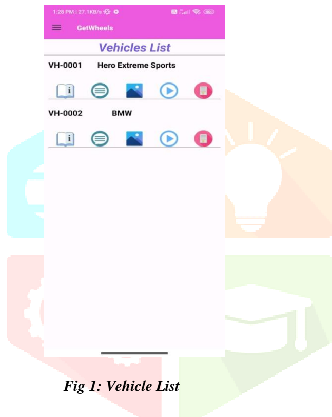
Fig 1: Vehicle List