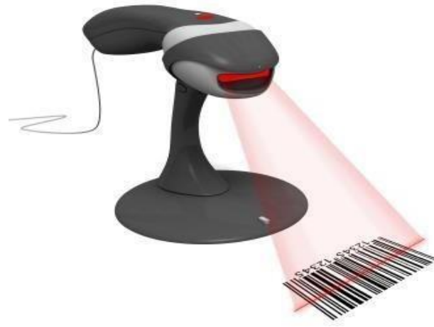
Fig 3. Scanner