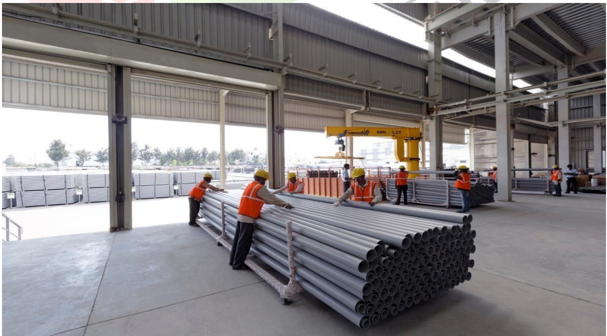
Fig 2. Packing & Printing Barcodes