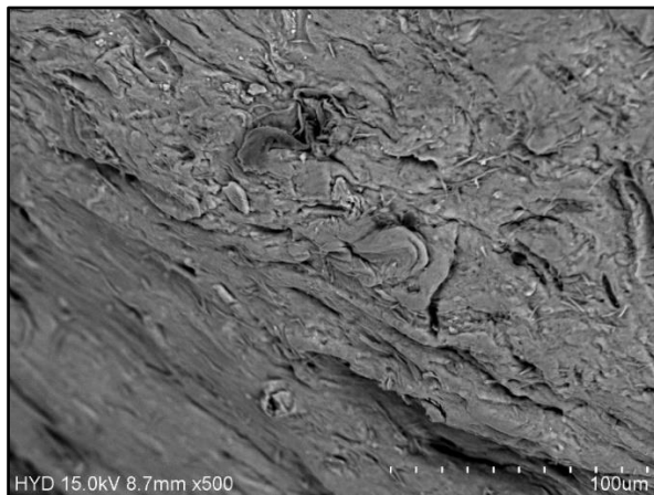
Fig no.2 : SEM photograph of optimized batch V4 of venlafaxine HCl

Scanning electron microscopy has been used to determine particle size distribution, and texture and to examine the morphology of the fractured or sectioned surface.