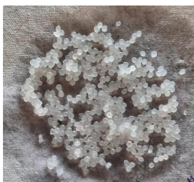
Fig no.1: Prepared microspheres before drying