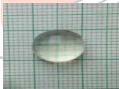
Fig f. Group 6