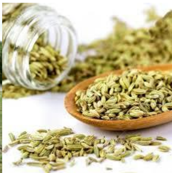
Fig 2- Fennel Seeds

Fennel ( Foeniculum vulgare ) is a traditional and popular herb with a long history of use as a medicine. A series of studies showed that F. Vulgare effectively controls numerous infectious disorders of bacterial, fungal, viral, mycobacterium, and protozoal origin. It has antioxidant, antitumor, chemopreventive, cytoprotective, hepatoprotective, hypoglycemic, and oestrogenic activities. Some of the publications stated that F. Vulgare has a special kind of memory-enhancing effect and can reduce stress. Animal experiments and limited clinical trials suggest that chronic use of F. Vulgare is not harmful. Fennel may be consumed daily, in the raw form as salads and snacks, stewed, boiled, grilled, or baked in several dishes and even used in the preparation of herbal teas or spirits. A diet with desired quantity of fennel could bring potential health benefits due to its valuable nutritional composition with respect to presence of essential fatty acids. In recent years, increased interests in improvement of agricultural yield of fennel due to its medicinal properties and essential oil content has encouraged cultivation of the plant on large scale.