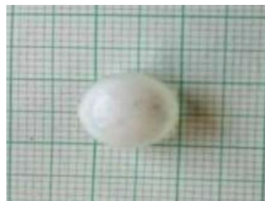
Fig b. Negative control(Group 2)