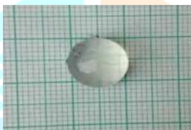
Fig c. Positive Control