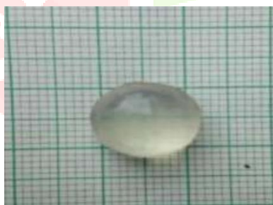
Fig e. Group 5