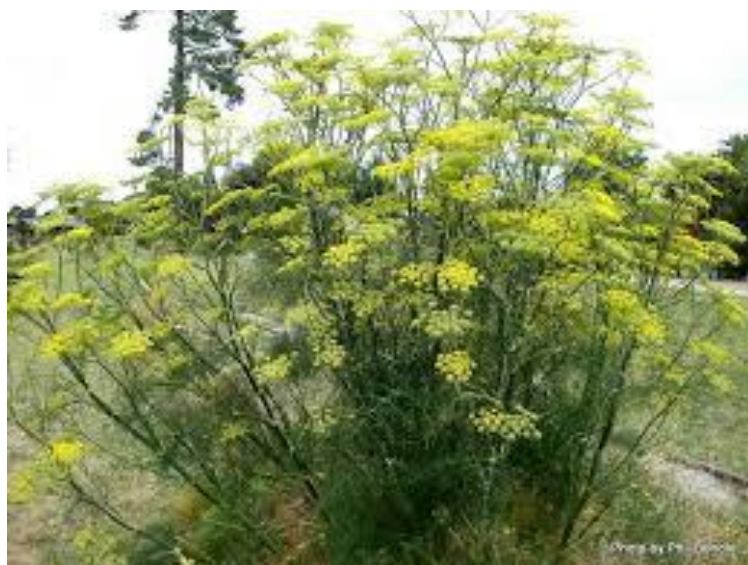
Fig 1- Fennel Plant