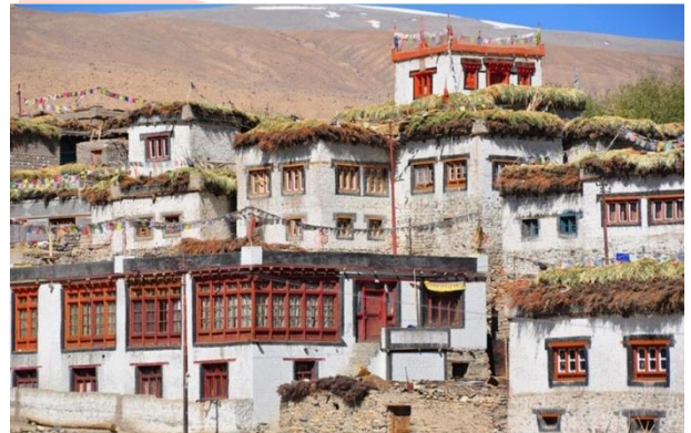
Typical House in Ladakh

heavy snow fall during winters. Ladakh experiences cold and sunny type of climate. This region have very little vegetation and is considered as a cold desert. The structures are designed using local materials like stone, mud and clay. The houses are very close to each other. This kind of climate requires buildings to be heated throughout the year. Thin mud and bamboo are used for walls on the upper floor and brick or bamboo for upper floors. Roof is made using stone slabs or country tiles. The roofs hang from all sides, providing protection of core spaces from all sides. A typical houses are either square or rectangular in shape. The houses are about two or three storeys high. Each story consists of huge single room without any partitions. Buildings are faced on the south or south-west to receive maximum sunlight. The houses are aligned parallel to the slope of the mountain and never perpendicular to it. The buildings are made from locally available stone and timber packed with clay and cow dung as mortar. The roof is finished with locally available slate.