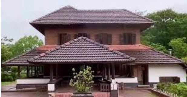
Typical House in Kerala

or two sides. Houses have sloping roof to protect from heavy rainfall. The house is blend into landscape of tree and vegetation. Houses have central courtyard with verandah on both sides for cross ventilation. Local materials are used such as laterite, granite, timber, mud, thatch, coconut leaves, bamboo and Mangalore tiles.