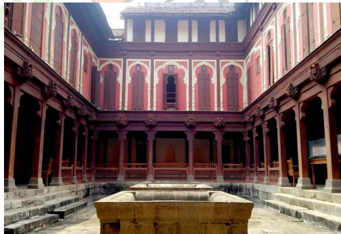
Wadas in Maharashtra