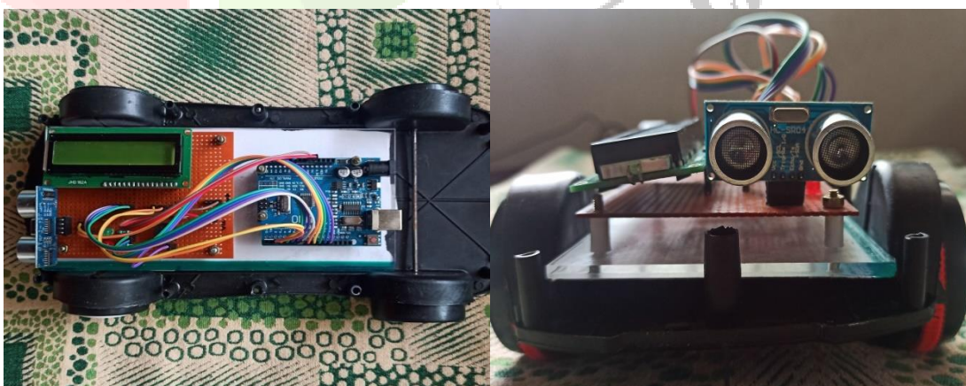
Figure 6 -hardware implementation