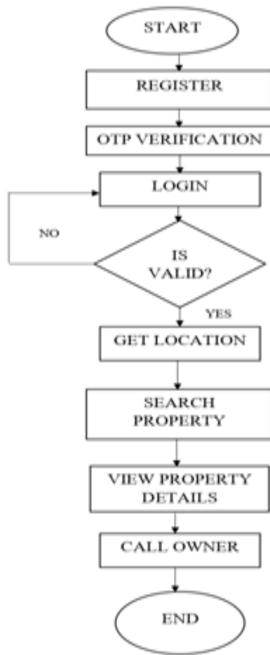
Figure 2: Flowchart of User