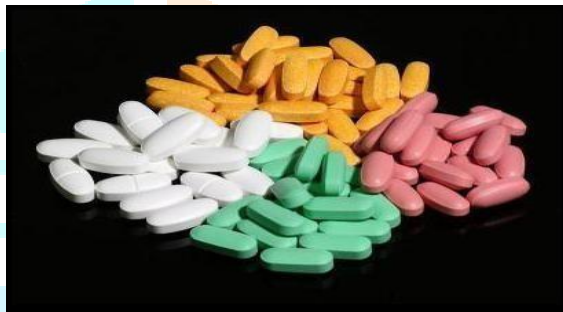
Figure no.1 showing tablets as a dosage forms

Tablets are solid dosage form containing medicament or medicaments, usually circular in shape and may be flat or biconvex. Tablets are prepared by compression method and are hence called the compression tablet.