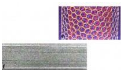
FIG. 2: MULTI-WALLED (MWNT) CARBON NANOTUBES (e, f)

technique was used for the synthesis of DWNT on the gram scale process and there were reduction of oxide solutions in hydrogen and methane 7 .