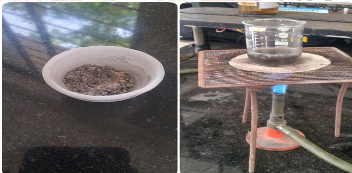
Fig 2: Determination of ash values