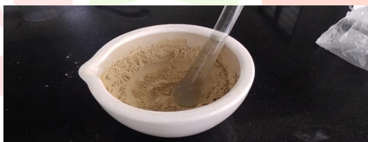
Fig 4: Dry mixing