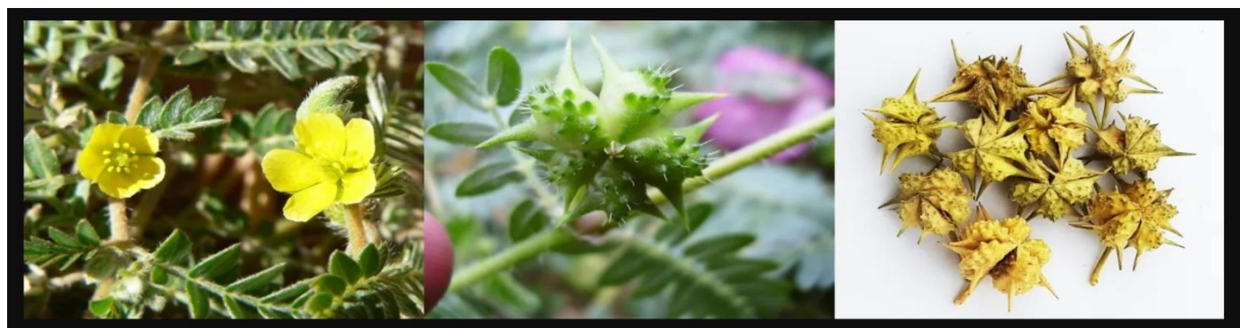
Figure 1: Tribulus terrestris plants

Plants' powdered fruits are commonly used for the desired activity.