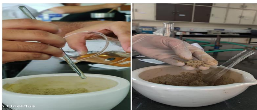
Fig 5: wet mixing