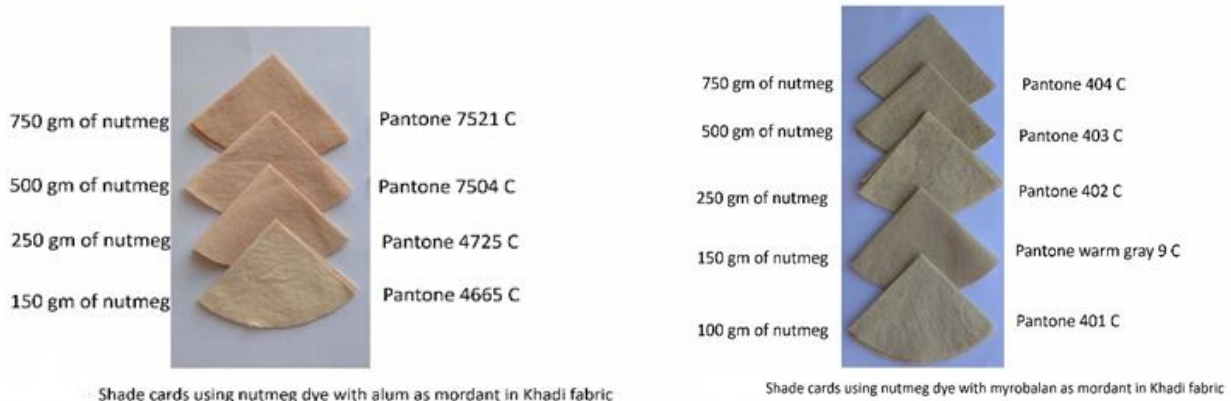
Fig.3.1 Shade card using Nutmeg Fruit in Khadi Fabric.