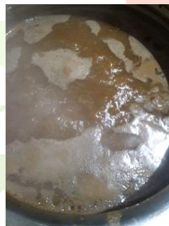
Fig 2.5 Preparation of Myrobalan

Indian purple yam is an underground vegetable, so first clean the Indian purple yam (removing the dust particles & small small roots). Peel the outer cover of the vegetable carefully. Next step is adding myrobalan to the solution as mordant. Stir it continuously for 10 mins for making the myrobalan to dissolve. After boiled for 30 mins filter it to get the dye solution. Sourcing of khadi fabric from the store for sampling. First step is to remove the starch and dust using normal plain water. Immerse the fabric in the dye solution and stir it continuously in clockwise and anticlockwise for 30 minutes. Continue for 6 hours without boiling temperature. Randomly stir the fabric for getting the evenness in the fabric. After mordanting and dyeing simultaneously done next step is to add fixatives. Add 5gm of salt and keeping it for 1 hour. After the mordanting, dyeing and fixative, make the dyed fabric to dried under shade condition.