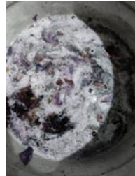
Fig.2.4 Adding alum