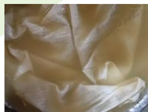
Fig.2.2 Immerse the washed khadi fabric to the dye solution