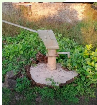
Current water Distribution Source