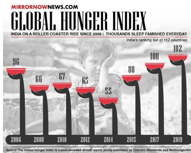
Global Starvation index(2006-2019) of India

Thus, we advocate to enforce an internet website to attach individuals who need to proportion extra meals and NGOs who can choose out it up and distribute to the needy.