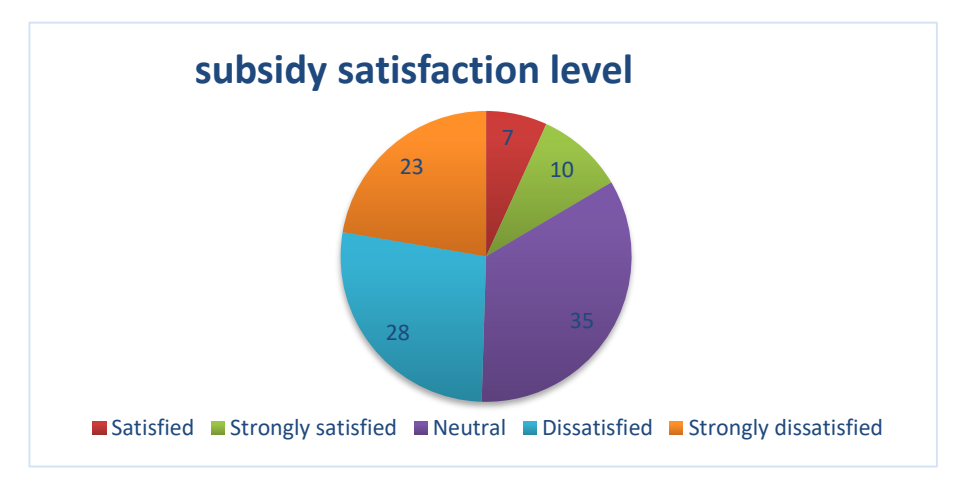
Chart no 2: satisfaction level of respondents for subsidy gained