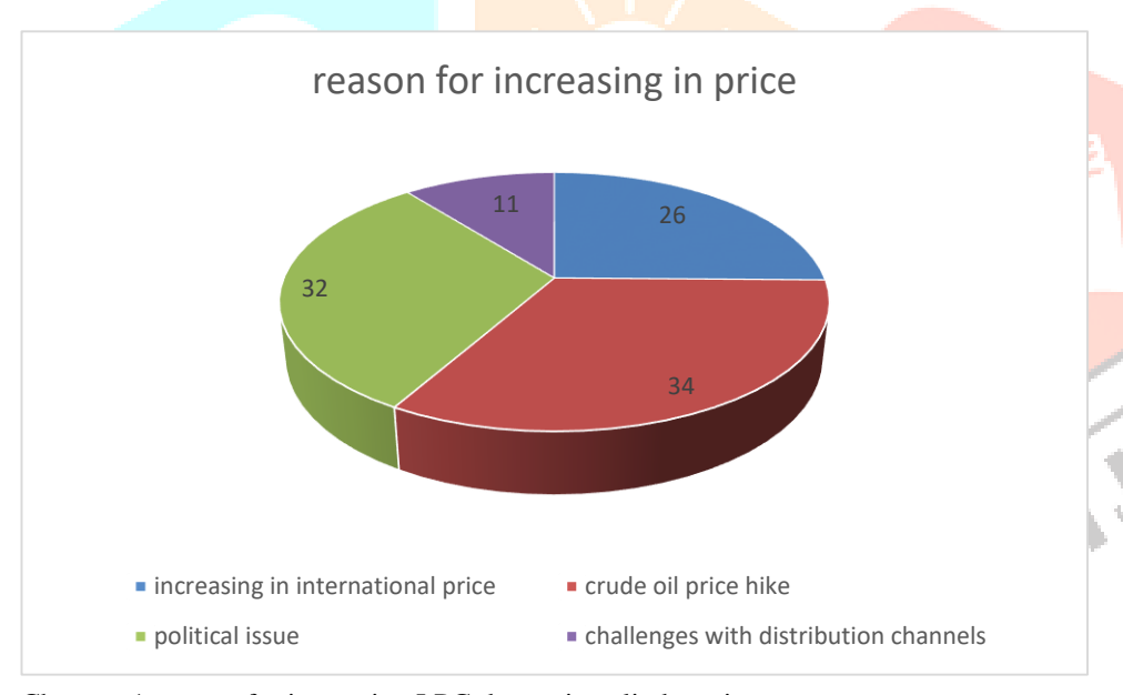
Chart no 1: reason for increasing LPG domestic cylinder price