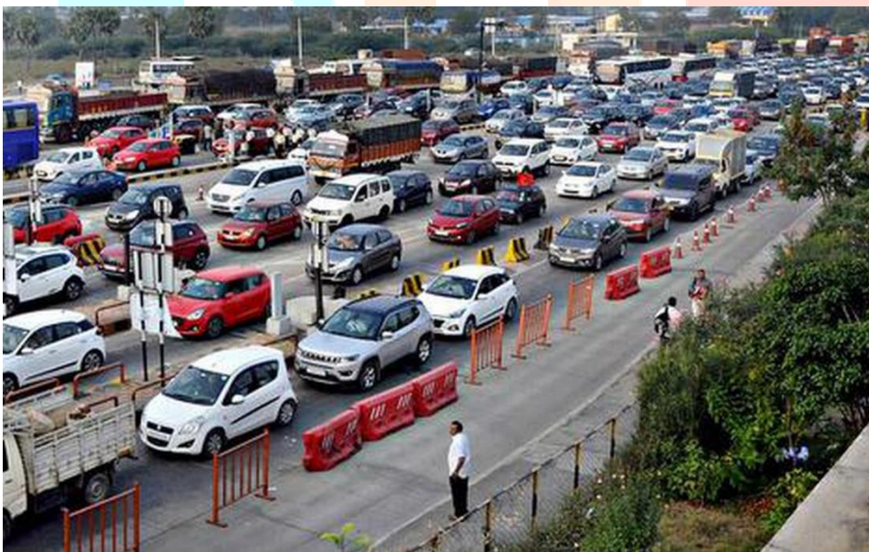
Fig 9 Panthangi Toll Plaza

In 2016-17, an aggregate of Rs 6,937 crore, in 2017-18, Rs 8,630 crore, and in 2018-19, Rs 9,187 crore is the complete income produced from the 549 functional cost squares the nation over. The highest toll cost charge was gathered from Uttar Pradesh adding up to Rs 1,525 crore in the monetary year of 2018-19.