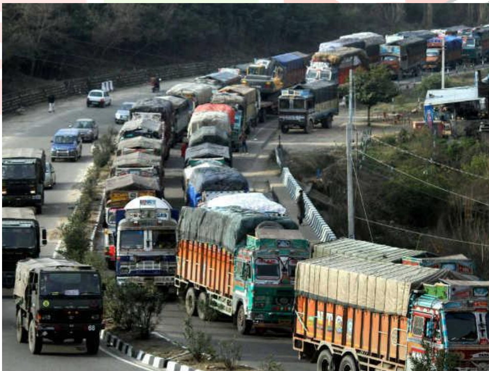
Fig 4: - Goods Transportation in NH44 (Srinagar)

Now a days travelling of people are increasing for different purposes like Business purpose, job purpose, family vacations, marriage vacations etc.