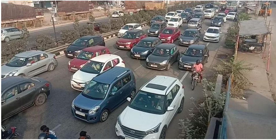
Fig 5 Heavy Traffic on NH65 (Nalgonda district)