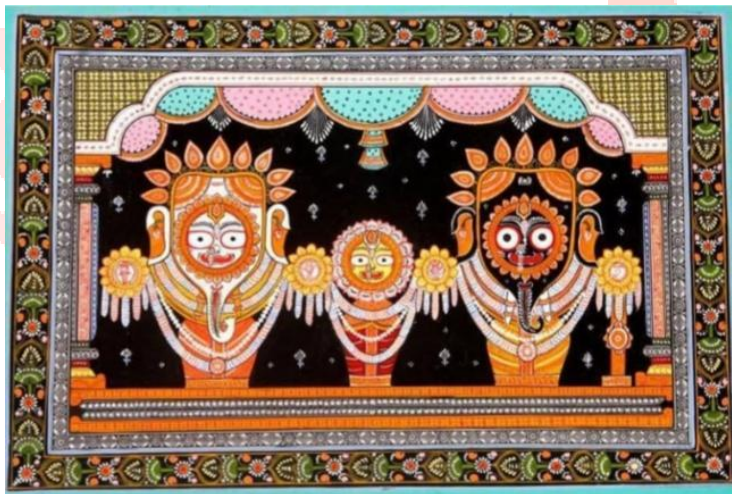
Fig 2 Pattachitra Painting (Odisha)

Similarly, like above mentions every state had their unique products in India.