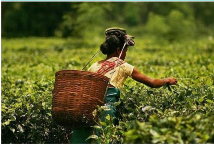
Fig 3 Tea Farming (Assam)