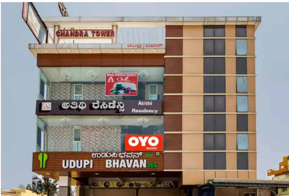
Fig 6 Hotels in NH44 (krishnagiri)