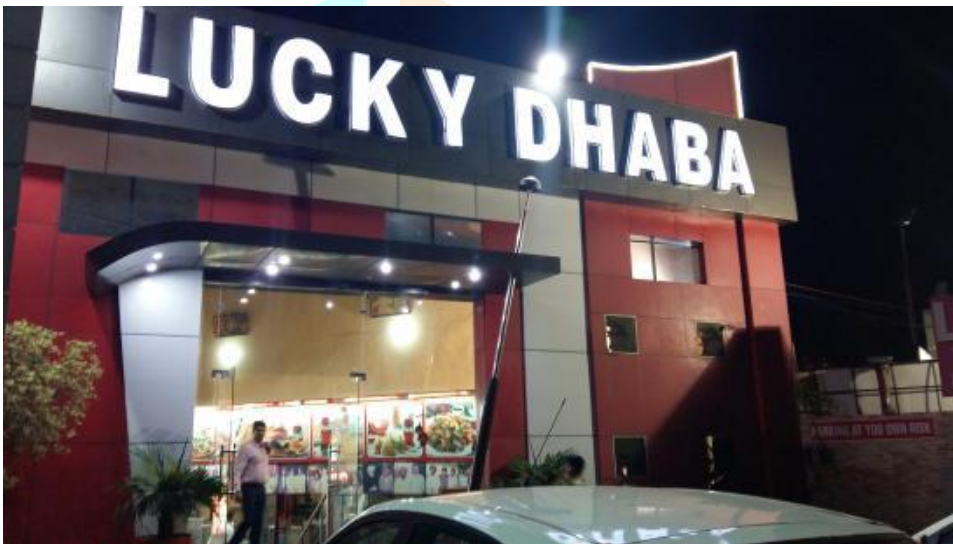
Fig 7 Lucky Dhaba in NH44 (Delhi)