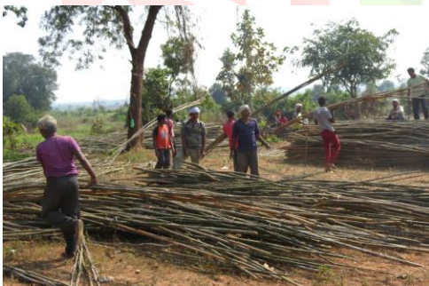
Bamboo's in warehouse