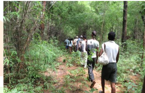
Peoples Protecting Forest's