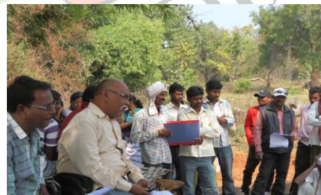
Auction of Bamboo's