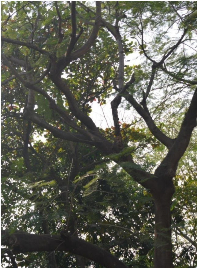
fig.no.1: delonix regia