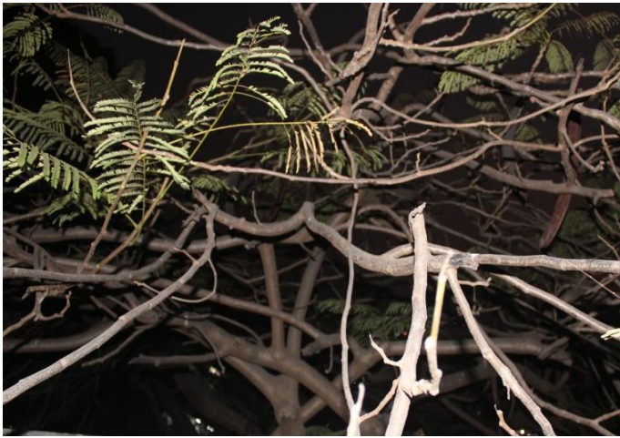
fig.no.5: branch &amp; stems