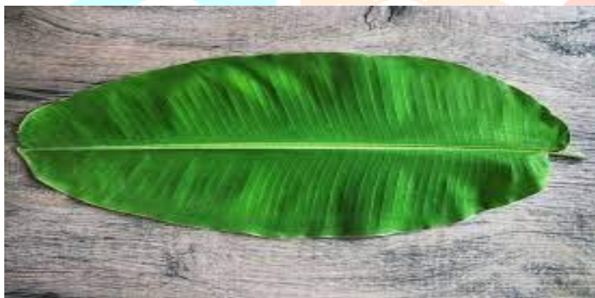
Fig. 3.1.1. BANANA LEAF