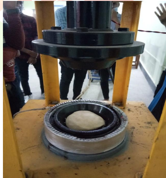
Fig.3.2.4. MOLDING AND DRYING MACHINE

For that molding process adjust 50 mm of Hg and 200°C for 15 to 30 minutes. After this adjusted pressure, temperature and time got targeted bio-degradable plate. After the preparation of flour plate babul gum (acacia nilotica) was applied for the application of top layer that is banana leaf. Acacia nilotica applied between two layer for proper bonding.