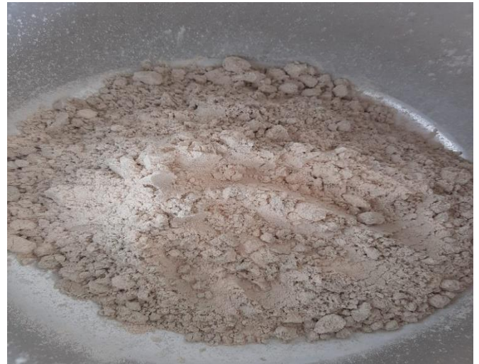
Fig.3.2.2. MIXED WHEAT & MAIDA FLOUR

After the mixed flour prepared dough. After the preparation of dough put that dough in molding and drying machine.