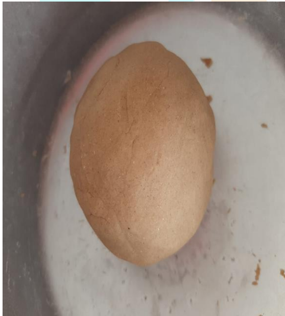
Fig. 3.2.3. PREPARE DOUGH (WHEAT & MAIDA)

After the mixed flour prepared dough. After the preparation of dough put that dough in molding and drying machine.