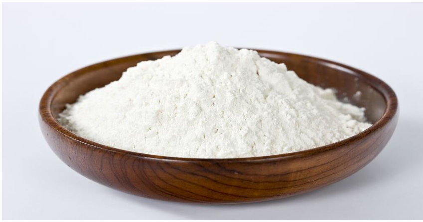
Fig, 3.1.2. WHEAT FLOUR