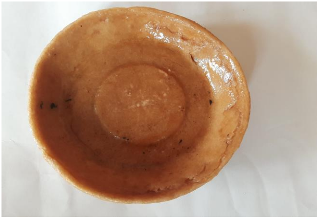
Fig. 3.2.5. FLOUR PLATE & APPLIED BABUL GUM