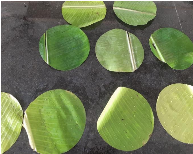
Fig. 3.2.1. CUTTING OF BANANA LEAVES

Frist of all cut banana leaves (musa leaves) and wash it properly & keep aside. Than took wheat flour and maida flour & mixed well.