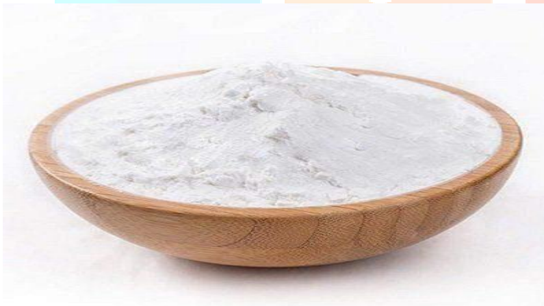
Fig, 3.1.3. MAIDA FLOUR