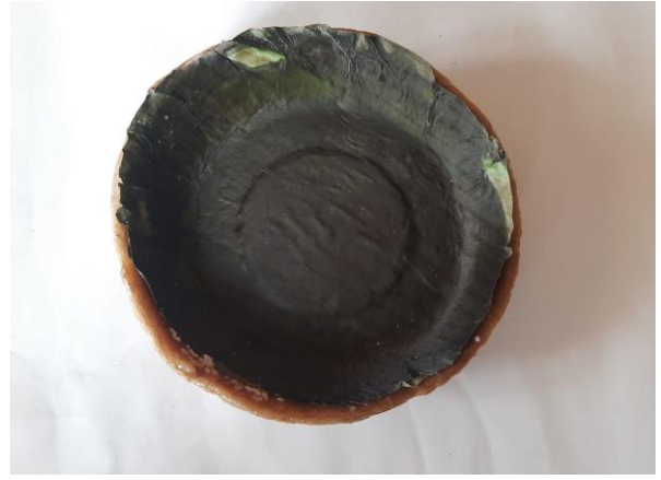
Fig. 3.2.6. TARGETED BIO-DEGRADABLE PLATE

Targeted plate made from flour, leaf and acacia nilotica (babul gum) as a binding agent. This plate is totally bio-degradable and non-toxic.