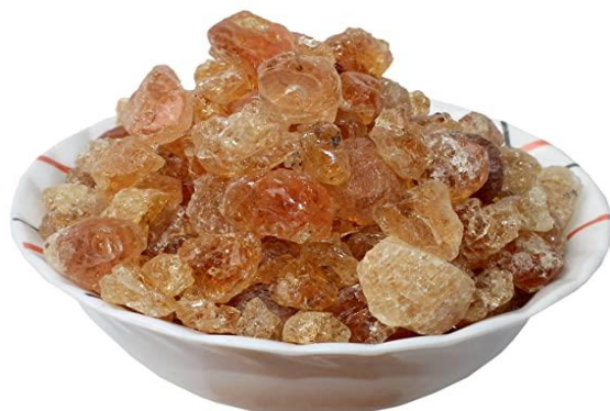
Fig. 3.1.4. ACACIA NILOTICA (BABUL GUM)