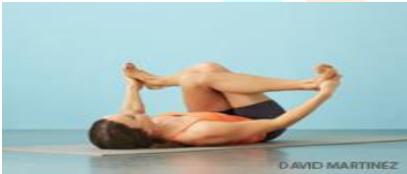
Low Lunge, variation (Anjaneyasana)

How to: Lie on your back and cross one knee over the other. Keeping your head on the floor, hug your knees in toward your chest. If you feel a good stretch, stay here. If you don't, flex your feet, grab your ankles, and pull them toward your hips. Hold for 1 minute, and then repeat with your legs crossed the other way.