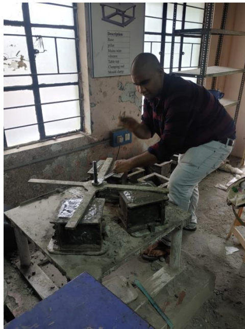
Fig.1 Compacting concrete in cube mould