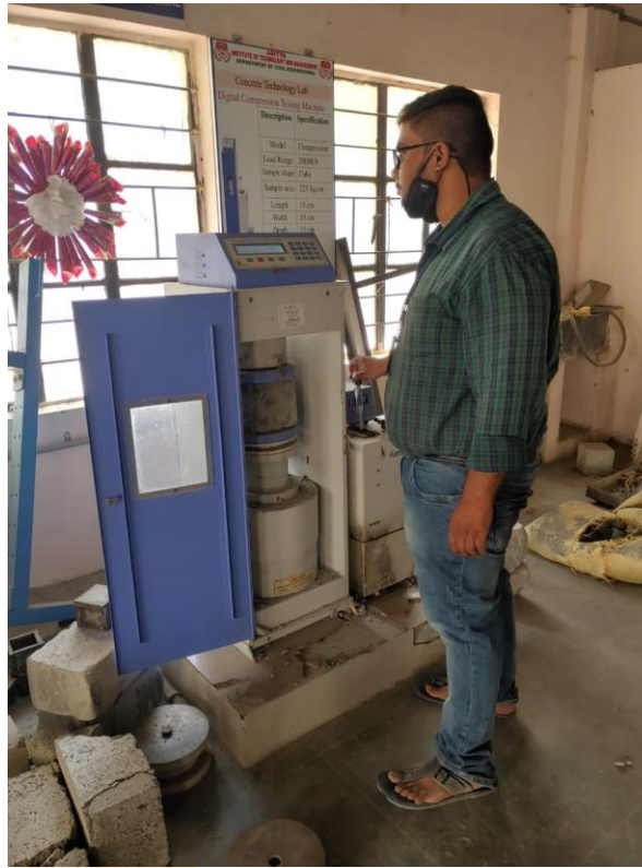
Fig.3 Specimen in compressive testing machine