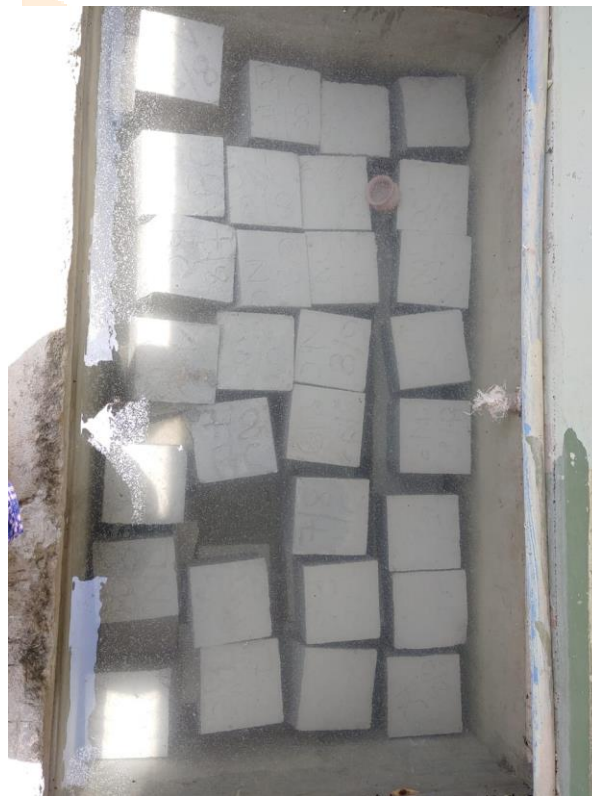
Fig.2 curing of cubes in water tank