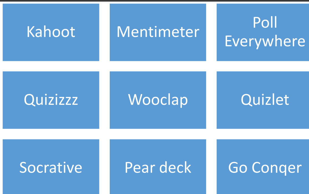
Fig. (ii) showing innovative tools for online formative assessment