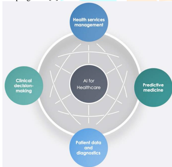
Fig I; Dominant variables for AI in healthcare.

In the absence of interpretive tools, combined clinical and genomic data have little value. When faced with a large amount of data, artificial intelligence methods have the potential to uncover clinically significant patterns, thereby meeting an existing demand [6]. With the capacity to classify patients based on this information, it is possible to improve their whole care, from risk assessment through diagnosis, early and continuing therapy to tracking response to therapy and prognosis [7].