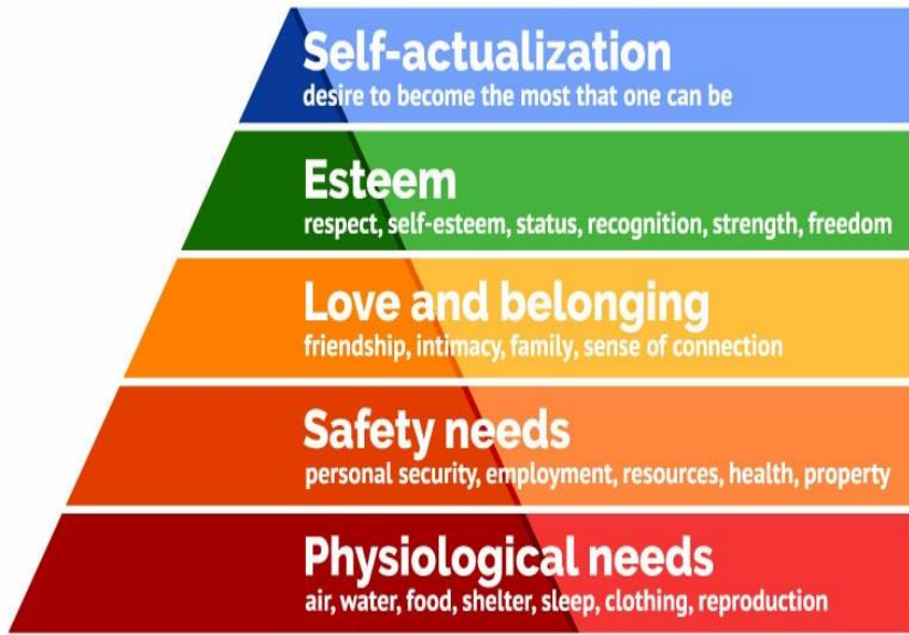
Figure-1, Maslow needs of hierarchy