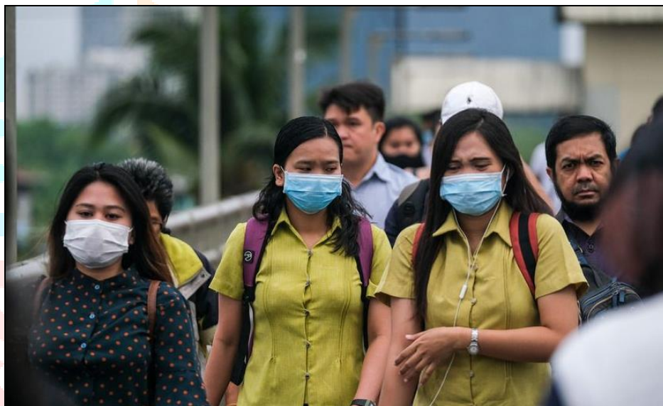
Figure 1. Represent the COVID 19 Pandemic Situation

Now a days there was a great usage of face mask publically due to the increase of number of Covid-19 cases which is reported in and around the world. Normally from a recent survey we came to know that people don't wear face mask to shield their health condition from air pollution but rather they use to hide their emotions from general public who try to watch their current activities. But now a day it is becoming very mandatory for each and every one to wear facemask to protect from spreading corona virus from one person to another. In 2020, we faced a lot of deaths due to corona virus and the world declared COVID 19 as international pandemic due to fast spreading of multiple covid deaths. This infection is increased over 6 million cases in not less than 10 days across 180 countries. This virus is mainly spread through close contact who is packed in certain crowded areas or inside a closed room through air. Hence the usage of face mask is becoming more and more mandate to prevent the fast spreading of this virus[1].